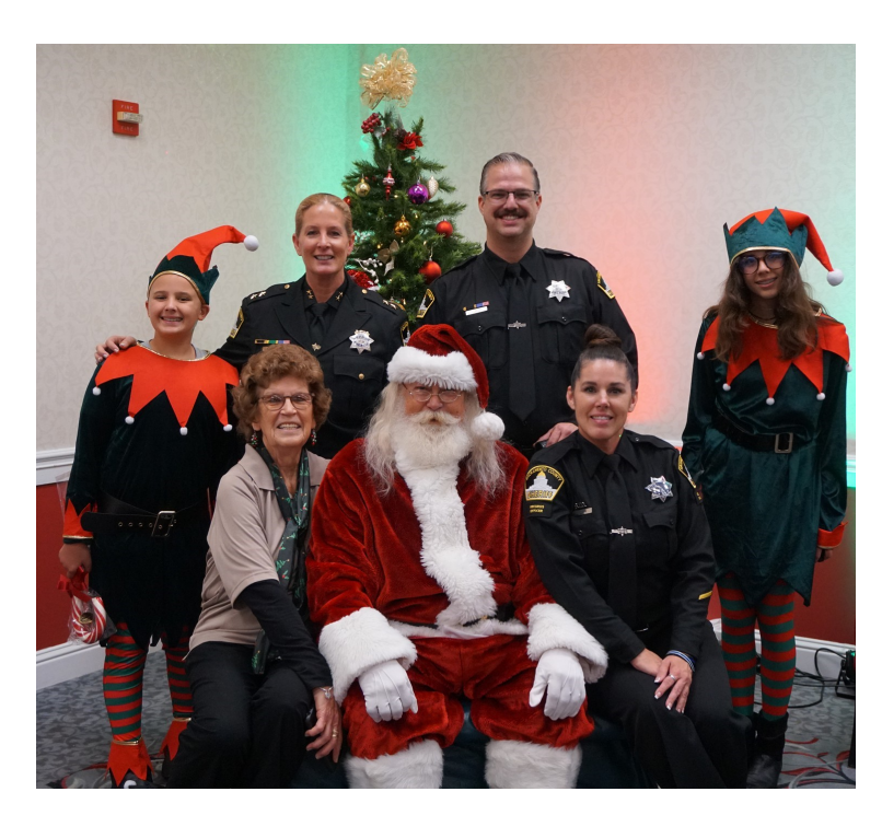
More pictures at www.cvipssa.com