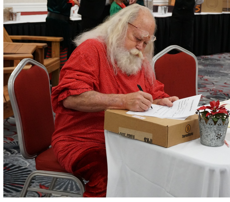
Making his list and checking it twice...